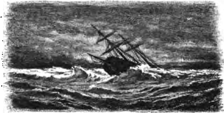
'Crossed in a storm.'

the goodness to write to him from time to time, to inform him of whatever he might wish to know, during his absence. He was much mortified to hear from the Doctor that he was obliged to remove, with his family, for some months, to a distant part of the north of England; and that, as to the Annalys, they were immediately removing to the sea coast of Devonshire, for the benefit of a mild climate, and of sea-bathing. Ormond, therefore, had no resource but in his guardian. Sir Ulick's business, however, was to take him over to London, from whence Ormond could not expect much satisfactory intelligence with respect to Ireland.